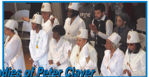
Ladies of Peter Claver