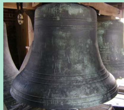
Bells from the tower of the former St. James Church