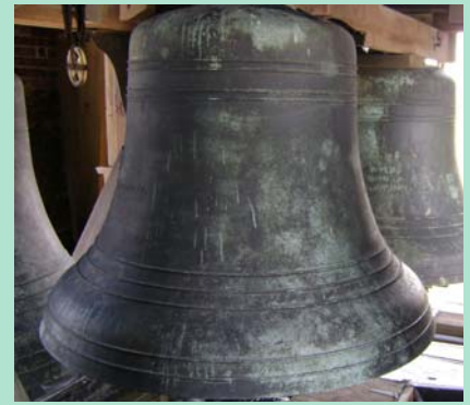
Bells from the tower of the former St. James Church

St. James Roman Catholic Church, a diverse community rooted in vibrant Eucharistic Liturgy, serves those in need in partnership with others.