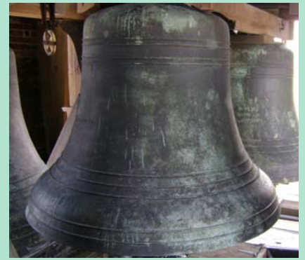
Bells from the tower of the former St. James Church

St. James Roman Catholic Church, a diverse community rooted in vibrant Eucharistic Liturgy, serves those in need in partnership with others.