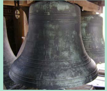
Bells from the tower of the former St. James Church

St. James Roman Catholic Church, a diverse community rooted in vibrant Eucharistic Liturgy, serves those in need in partnership with others.