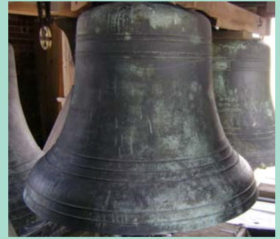
Bells from the tower of the former St. James Church

St. James Roman Catholic Church, a diverse community rooted in vibrant Eucharistic Liturgy, serves those in need in partnership with others.