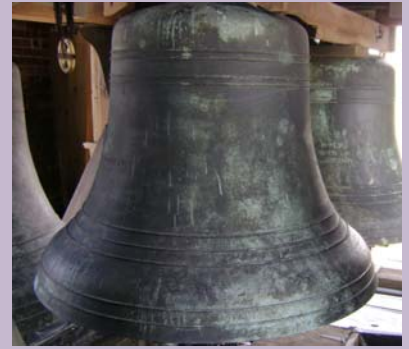
Bells from the tower of the former St. James Church

St. James Roman Catholic Church, a diverse community rooted in vibrant Eucharistic Liturgy, serves those in need in partnership with others.