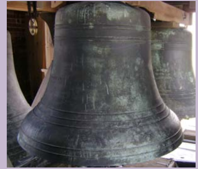
Bells from the tower of the former St. James Church

St. James Roman Catholic Church, a diverse community rooted in vibrant Eucharistic Liturgy, serves those in need in partnership with others.