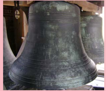
Bells from the tower of the former St. James Church

St. James Roman Catholic Church, a diverse community rooted in vibrant Eucharistic Liturgy, serves those in need in partnership with others.