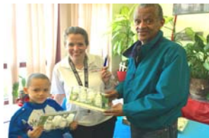
ComEd Rep supplying free energy saving lightbulbs at the food pantry Tuesday, March 8, 2016.

Jumpstart your savings with Peoples Gas and ComEd®. You'll receive a FREE personalized energy assessment and FREE energy-saving products with installation. FREE products may include: Programmable thermostats, ENERGY STAR® certified CFLs, smart power strips, WaterSense® certified showerheads,