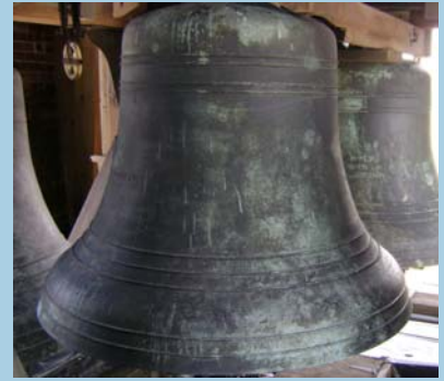
Bells from the tower of the former St. James Church

St. James Roman Catholic Church, a diverse community rooted in vibrant Eucharistic Liturgy, serves those in need in partnership with others.