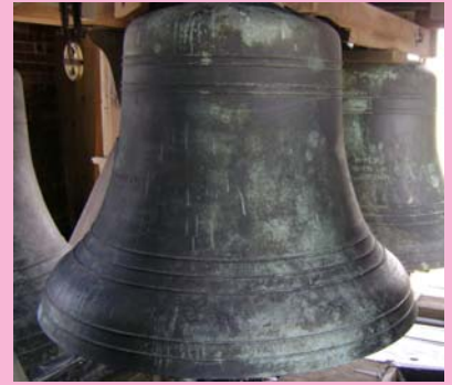
Bells from the tower of the former St. James Church

St. James Roman Catholic Church, a diverse community rooted in vibrant Eucharistic Liturgy, serves those in need in partnership with others.