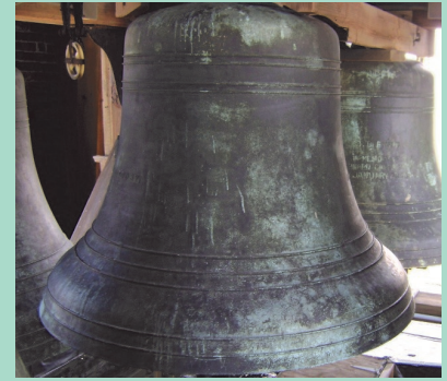
Bells from the tower of the former St. James Church

St. James Roman Catholic Church, a diverse community rooted in vibrant Eucharistic Liturgy, serves those in need in partnership with others.