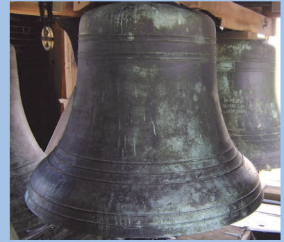
Bells from the tower of the former St. James Church

St. James Roman Catholic Church, a diverse community rooted in vibrant Eucharistic Liturgy, serves those in need in partnership with others.