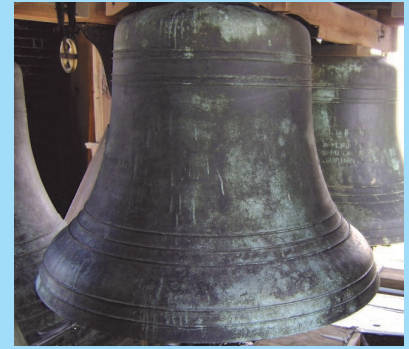
Bells from the tower of the former St. James Church

St. James Roman Catholic Church, a diverse community rooted in vibrant Eucharistic Liturgy, serves those in need in partnership with others.