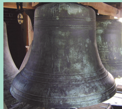
Bells from the tower of the former St. James Church

St. James Roman Catholic Church, a diverse community rooted in vibrant Eucharistic Liturgy, serves those in need in partnership with others.