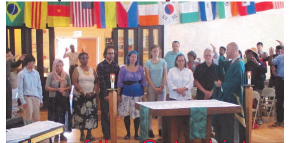
Blessing of the Catechists