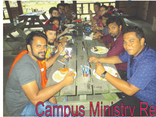
Campus Ministry Retreat