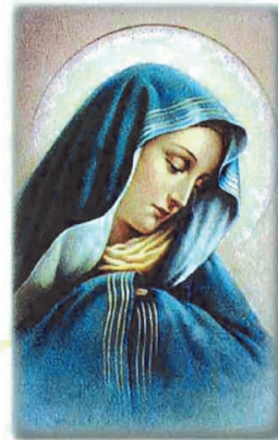
"Behold your Mother" (Jn 19.27)