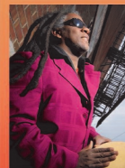
Angel D' Cuba Main Event