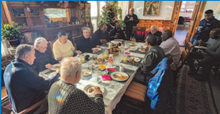
From the Men's Brunch held on December 14th.

The parish offices will be closed December 24 to January 4.